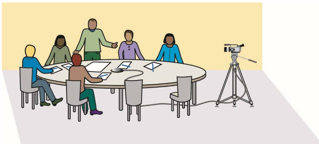
View of a small group showing best camera and microphone placement